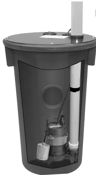
GWP2_ with WW05 Pump