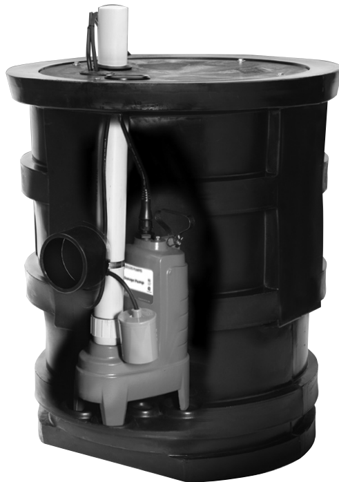
GWP1_ with PS Pump